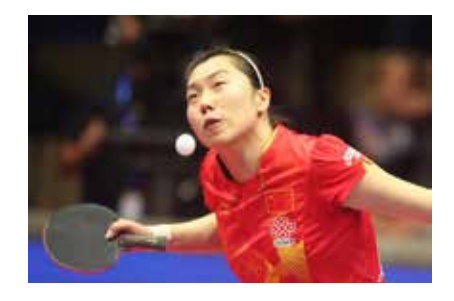
Li Xiaoxia (CHN) • No. 3