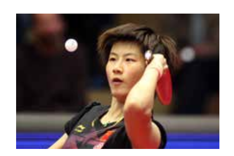
Ding Ning (CHN) • No. 1